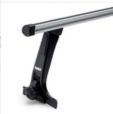
Gutter Foot (9511/9521/9531) – for vehicles with rain gutter.