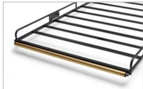
Heavy-Duty Basket welded in steel – with double powder coating ensuring premium quality and safety. The perfect platform for carrying all kinds of loads. Customized fit to each van. (Item No. see Thule Professional Fit Guide.)