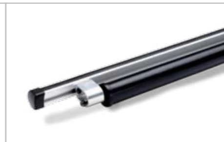
Roller (334) – ideal solution for sliding larger pipes, for example, onto the Heavy-Duty Bars, while helping to protect the roof of the work van. The soft surface protects the load during loading