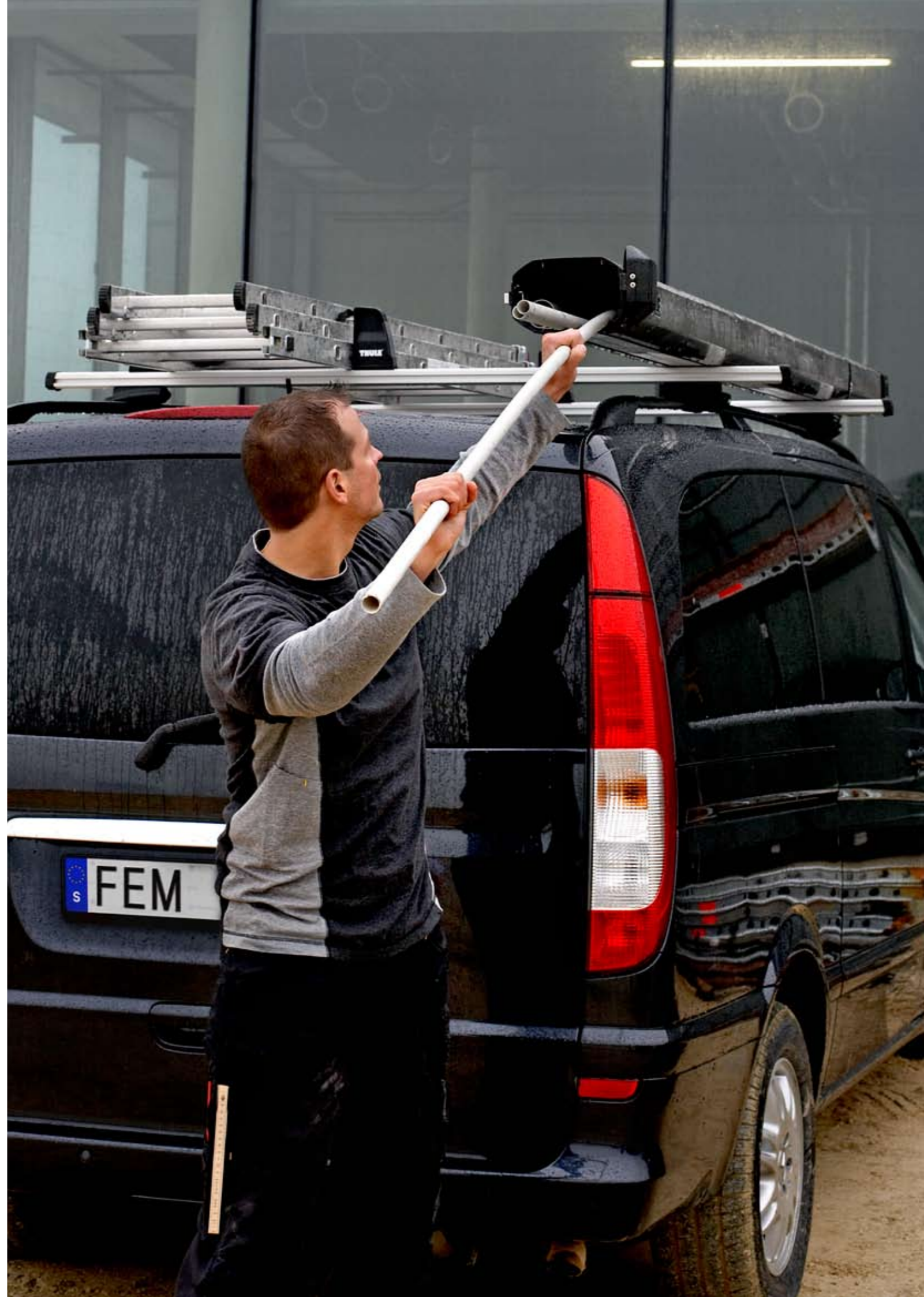
Conduit Box (317) – ingenious design with double openings makes it easy to load, separate and transport conduits safely and securely. Made in stainless steel.