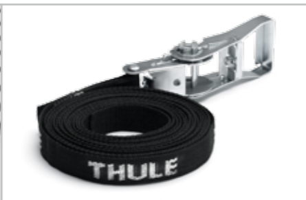
Ratchet Tie-Down (323) – easy-to-use fastener secures the load quickly, safely and reliably. 0,4 + 4,1 m in length, with S hooks, ideal for hooking onto the Eyebolt.