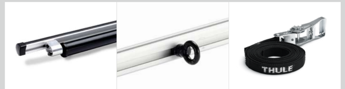
Roller (334) – makes loading of longer items, such as ladders and planks a lot easier, while helping to protect the top and back of the vehicle. • Length: 65cm and 110cm. • Material: Aluminium profile, covered with soft plastic (TPE) surface.