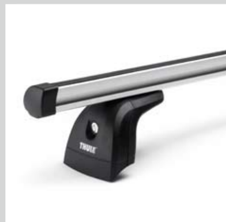
Rapid Fixpoint XT (751) – for vehicles with built-in fixpoints.