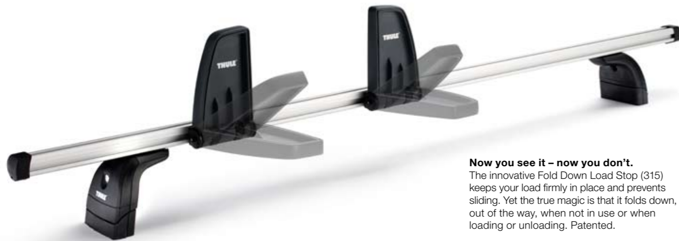
Now you see it – now you don't. The innovative Fold Down Load Stop (315) keeps your load firmly in place and prevents sliding. Yet the true magic is that it folds down, out of the way, when not in use or when loading or unloading. Patented.

At Thule, our design philosophy is clear: to apply creative thinking and technological innovation to develop the best possible solutions to real needs. This is true whether we're designing new functionality, identifying the right materials or fine-tuning aerodynamics. A perfect example is the Fold Down Load Stop.