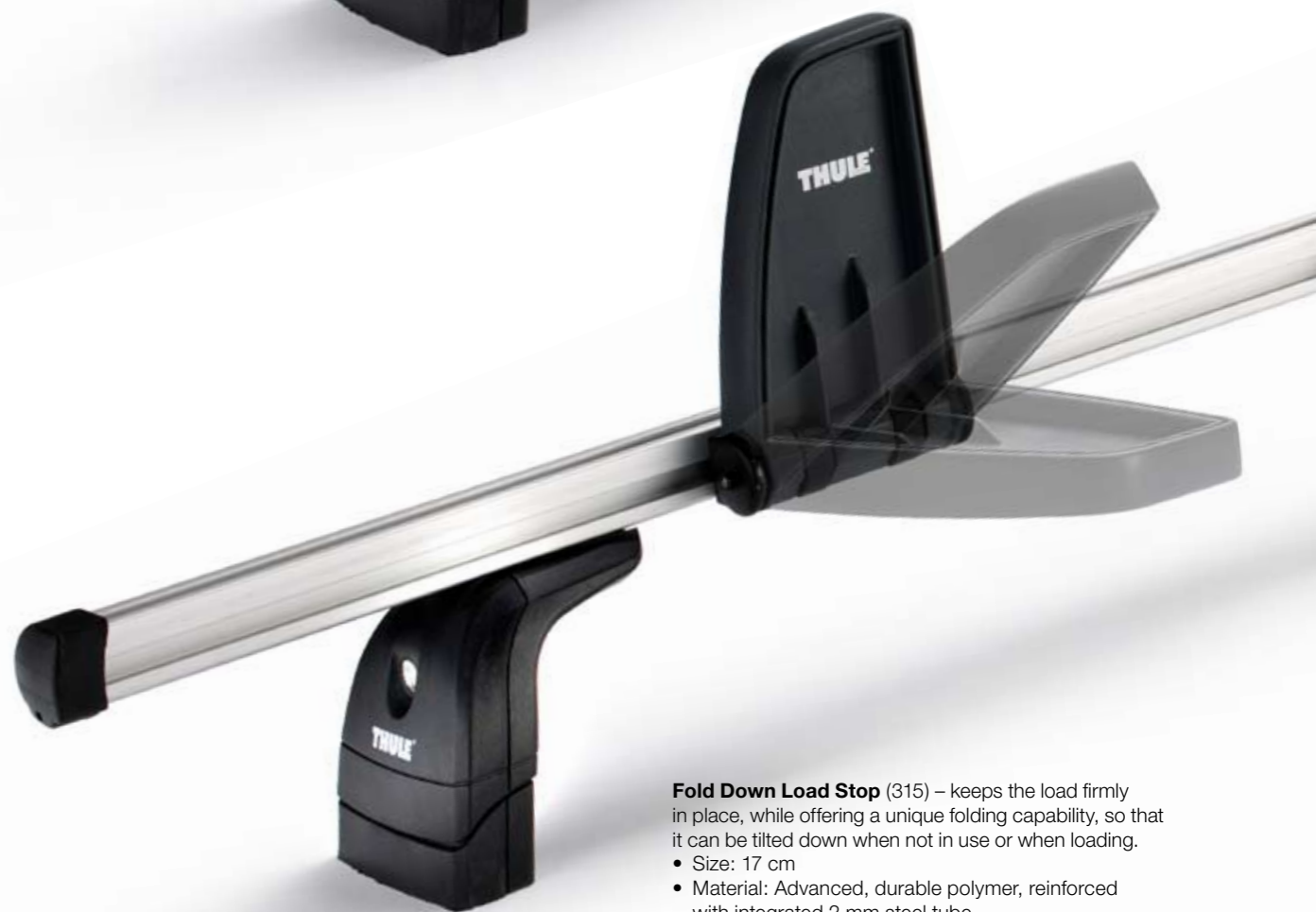
Fold Down Load Stop (315) – keeps the load firmly in place, while offering a unique folding capability, so that it can be tilted down when not in use or when loading. • Size: 17 cm • Material: Advanced, durable polymer, reinforced with integrated 2 mm steel tube