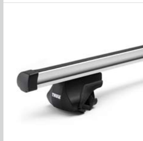
Rapid Railing (755) – for vehicles with roof rails.