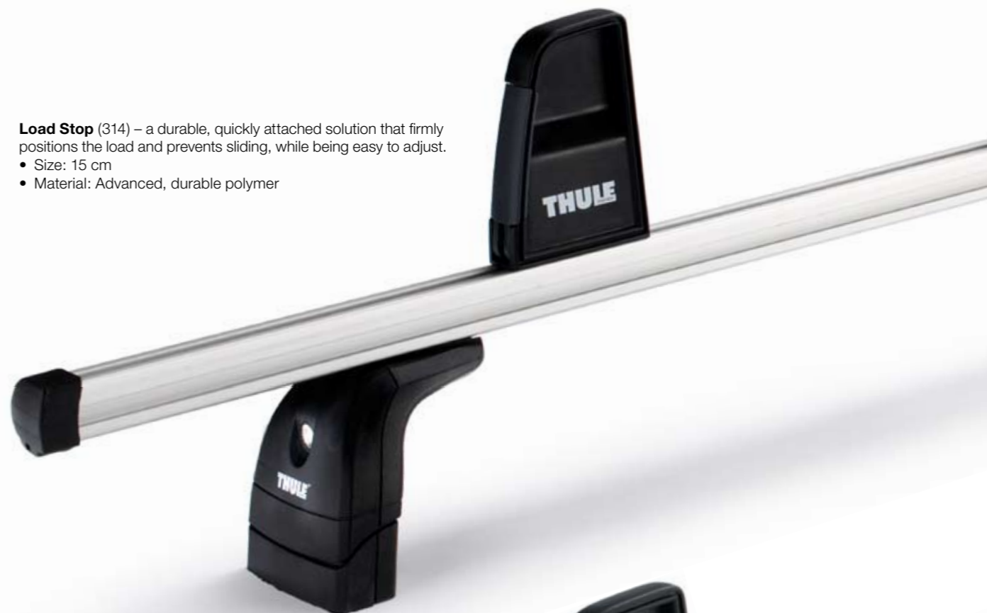
Load Stop (314) – a durable, quickly attached solution that firmly positions the load and prevents sliding, while being easy to adjust. • Size: 15 cm • Material: Advanced, durable polymer

For technical details, please refer to page 20.