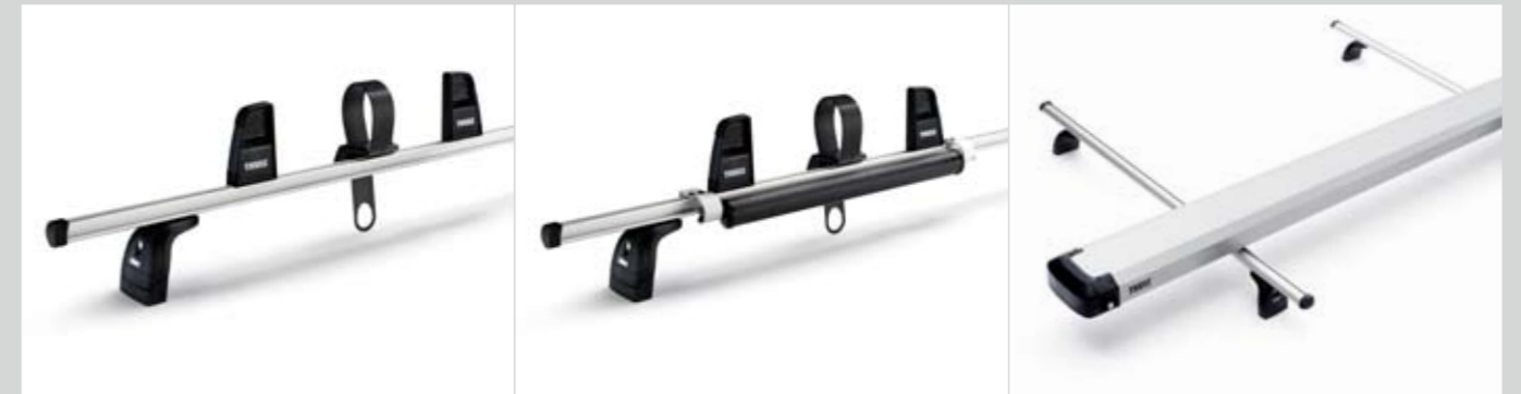
Ladder Holder (330) – features a unique fastening solution based on robust straps with a ratchet mechanism for quick and easy loading and unloading.