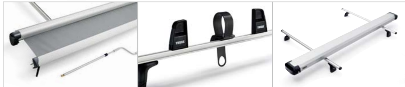
Awning (326–328) – mounts to the crossbars and operates from the side of the vehicle, providing waterproof, UV protection during harsh weather conditions.