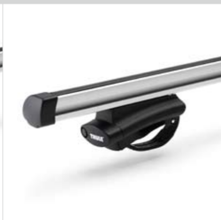
Rapid Crossroad (775) – for vehicles with roof rails.