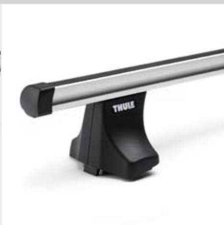
Rapid System (750) – for vehicles with normal roof.