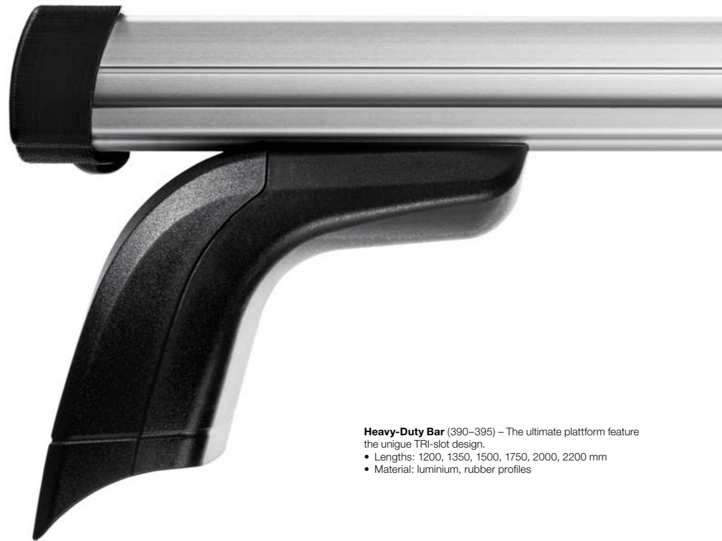
Heavy-Duty Bar (390–395) – The ultimate platform feature the unique TRI-slot design. • Lengths: 1200, 1350, 1500, 1750, 2000, 2200 mm • Material: aluminium, rubber profiles

Here is a closer look at the range of products that make up the dynamic Thule Professional load carrier system.