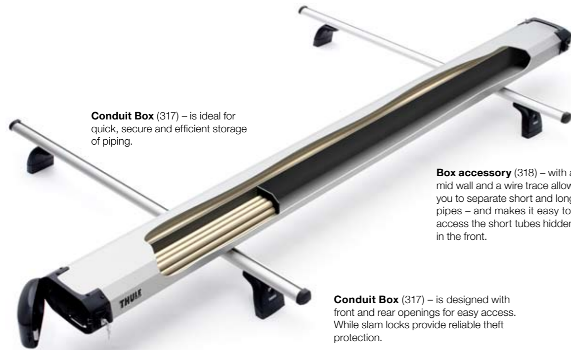
Conduit Box (317) – is ideal for quick, secure and efficient storage of piping.

Time is money – it's also a competitive success factor. Being able to save 10–15 minutes here and there during the week adds up. Opening up opportunities to either take on more jobs or perhaps get off work earlier. Just take a closer look at our ingenious Conduit Box. Loading, organizing and transporting pipes of different lengths couldn't be easier.