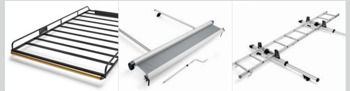
Heavy-Duty Basket* (Item No. see Thule Professional Fit Guide) – Two powder coating layers for maximum durability and scratch-proofing: the first layer makes the baskets corrosion resistant, whilst the second layer enhances the mechanical strength. • Size: Please see Thule Professional Fit Guide for the best solution for your car. • Material: Steel.