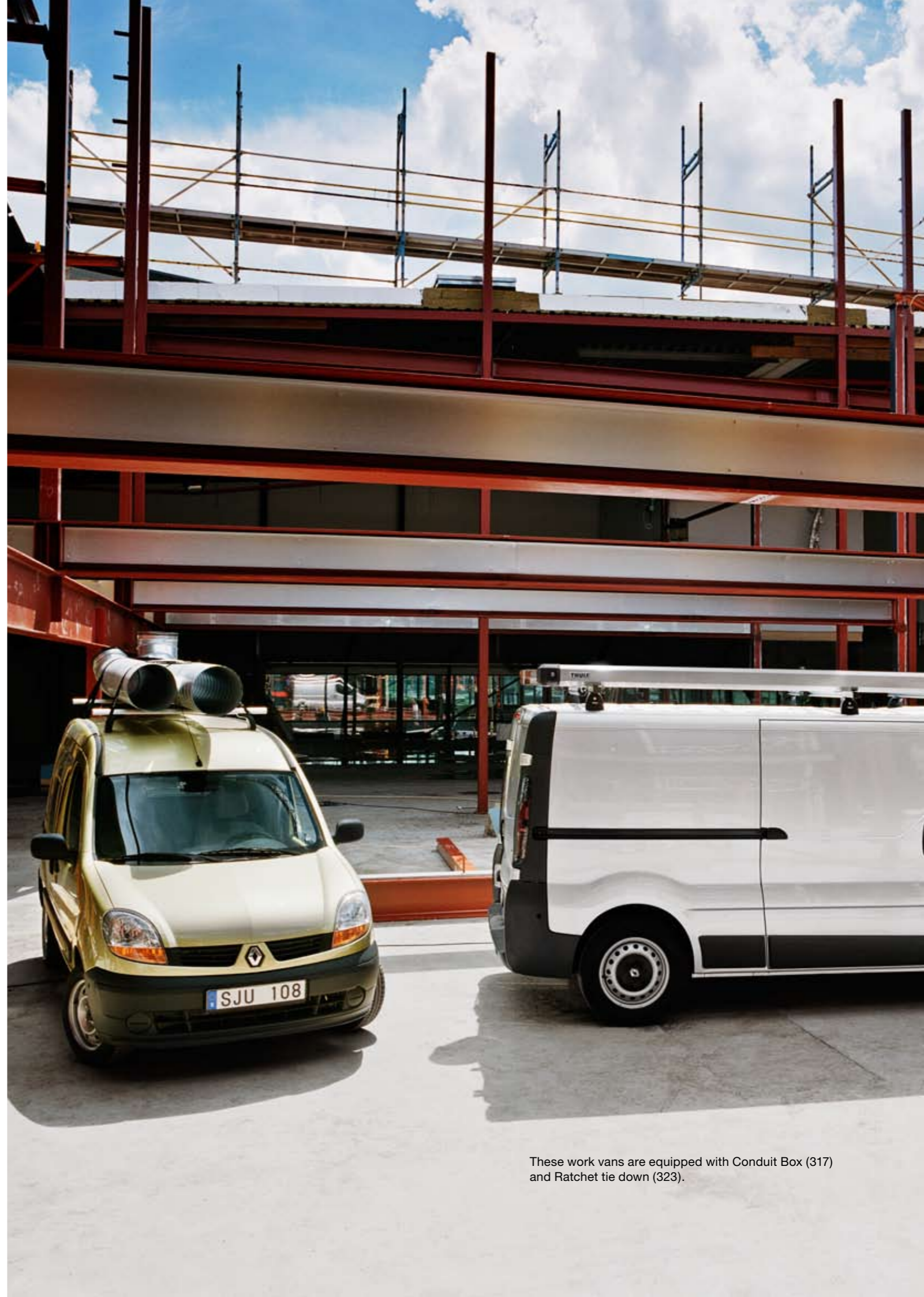
These work vans are equipped with Conduit Box (317) and Ratchet tie down (323).

Building your own Thule Professional load carrier system could not be easier. For all the inspiring details, just go to our website. Here you explore all the possibilities – and design your own system.