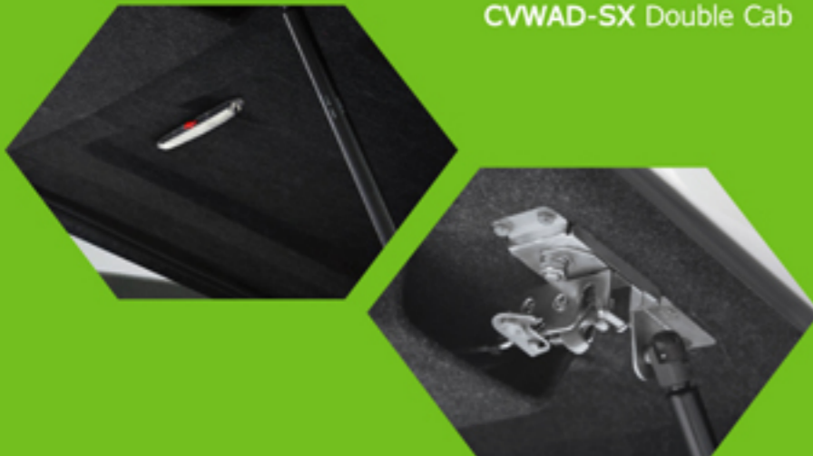
Rotary lock and latch