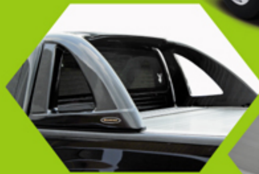
Roller lid with roll bar