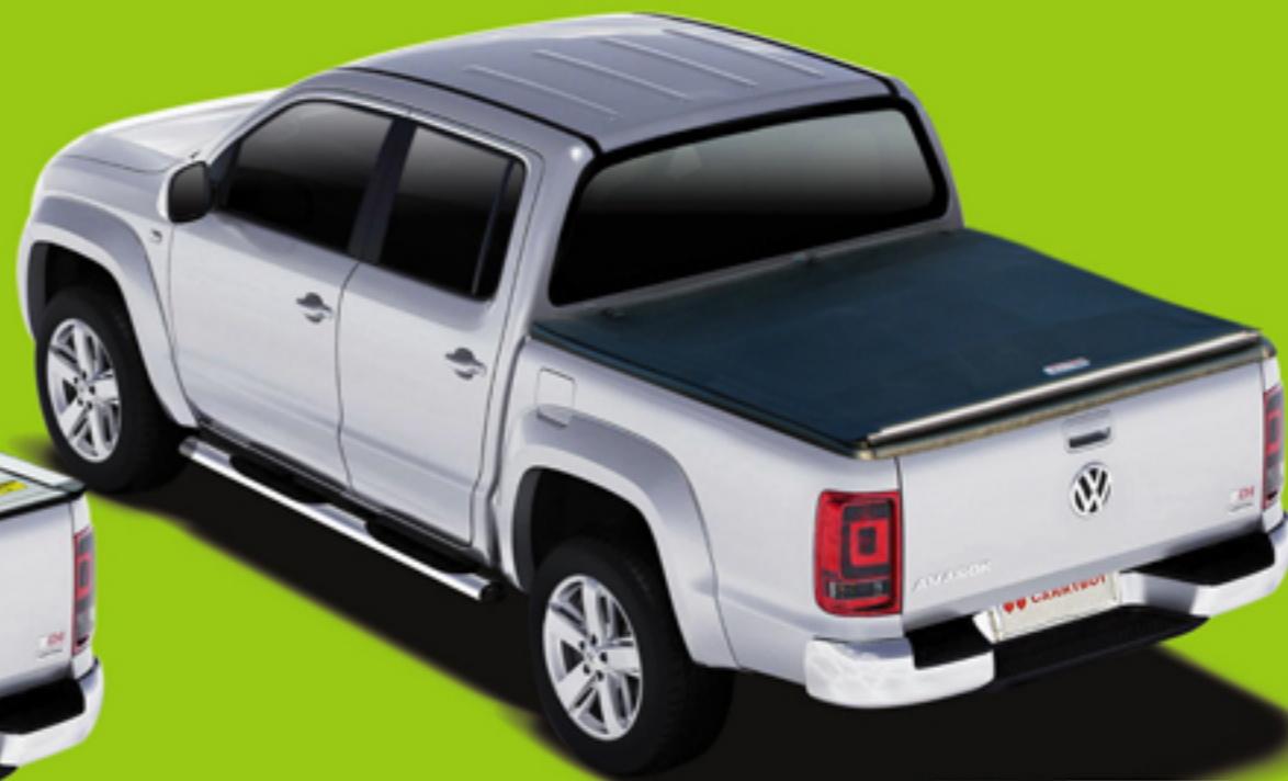
Easy lock and unlock

The convenient usage to close and open. Locking system for making the PVC plain and smooth finish look.