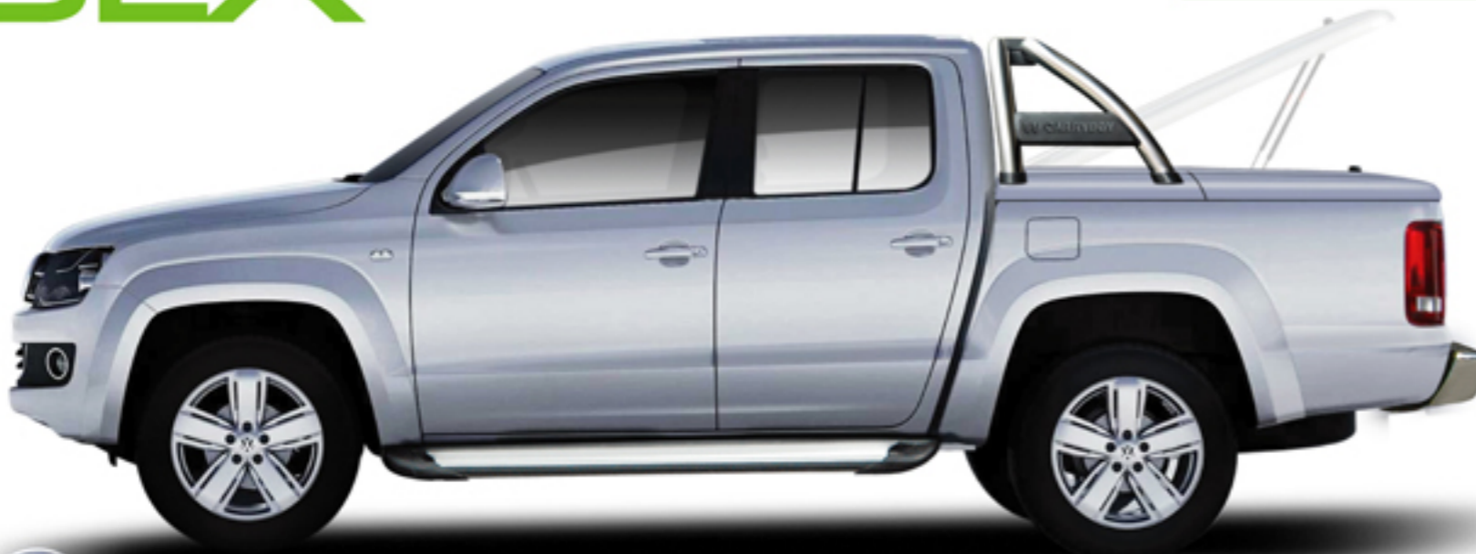
CVWAD-SLX Double Cab